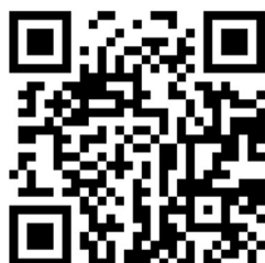
DALIAN UNIVERSITY OF TECHNOLOGY