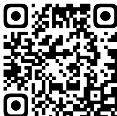
SCHOOL OF INTERNATIONAL EDUCATION